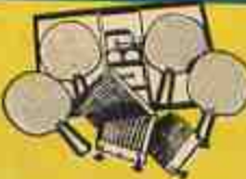
TABLE TENNIS SET